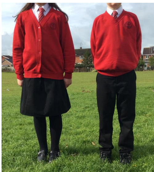
KS2 (Years 5 & 6)

Parents are free to buy from other outlets, provided the items comply with those available from our recommended supplier. The school reserves the right to reject non-specification items of uniform. For this reason, we recommend that school uniform suppliers are used, rather than fashion clothing outlets.