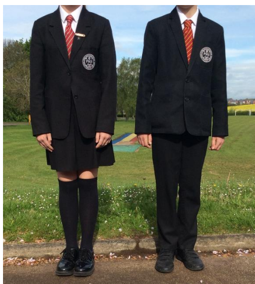
KS3 (Years 7 & 8)